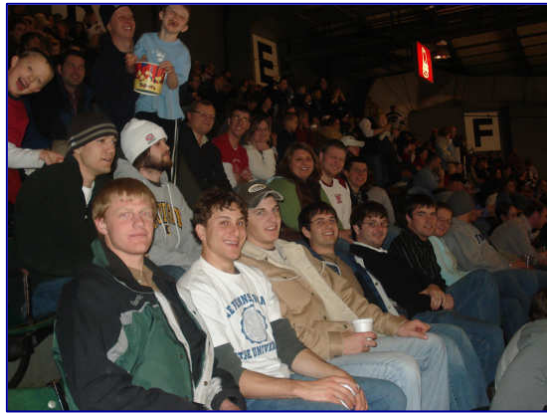
The entire group at the Sioux Falls Arena

The group then met up at the Sioux Falls Arena to cheer on the Sioux Falls Stampede as they played the Cedar Rapids Rough Riders in the United States Hockey League (USHL). There were 29 members, family and friends with our group to cheer the Stampede on to their 5-1 victory that night!